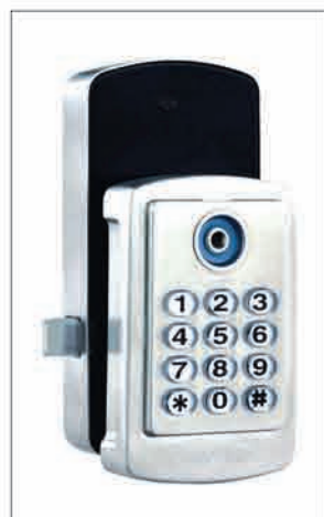
Cyber Digit Classic