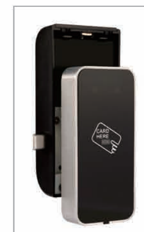
Cyber II RFID