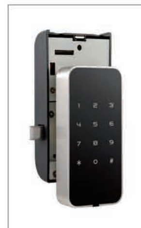
Cyber II Touch