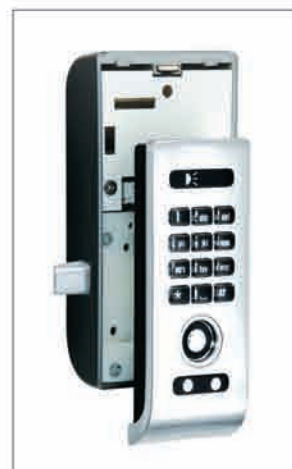
Cyber Digit Slim