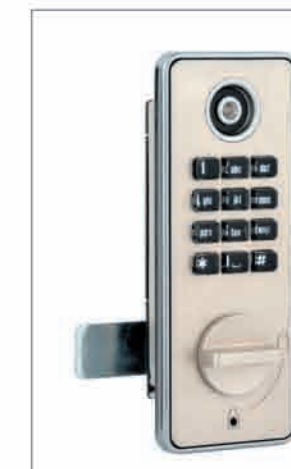
Cyber Digit Cam